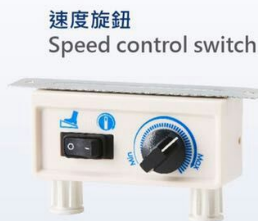
速度旋鈕 Speed control switch